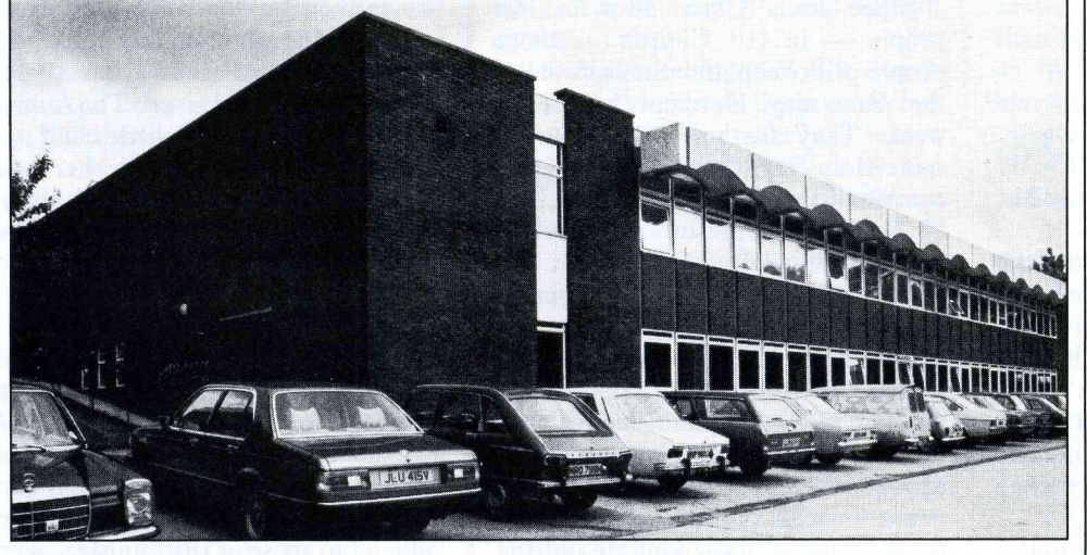
Exterior view of the press complex at Radlett, England.

So while an era may have passed with the college closure, the Church in the United Kingdom continues to fulfill its main objective preaching the Gospel to the British people.